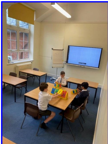
The Courtyard Room