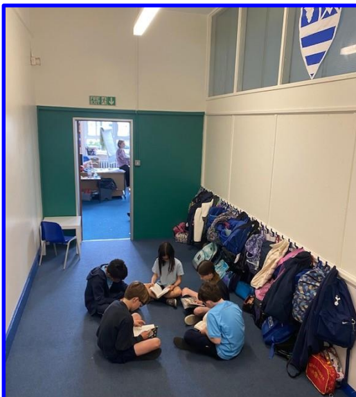
Year 5 class areas