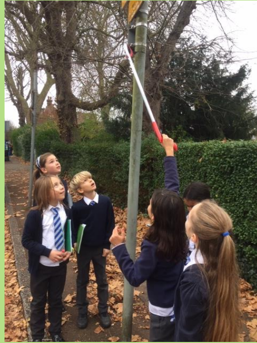
Measuring air pollution in Merton Hall Road